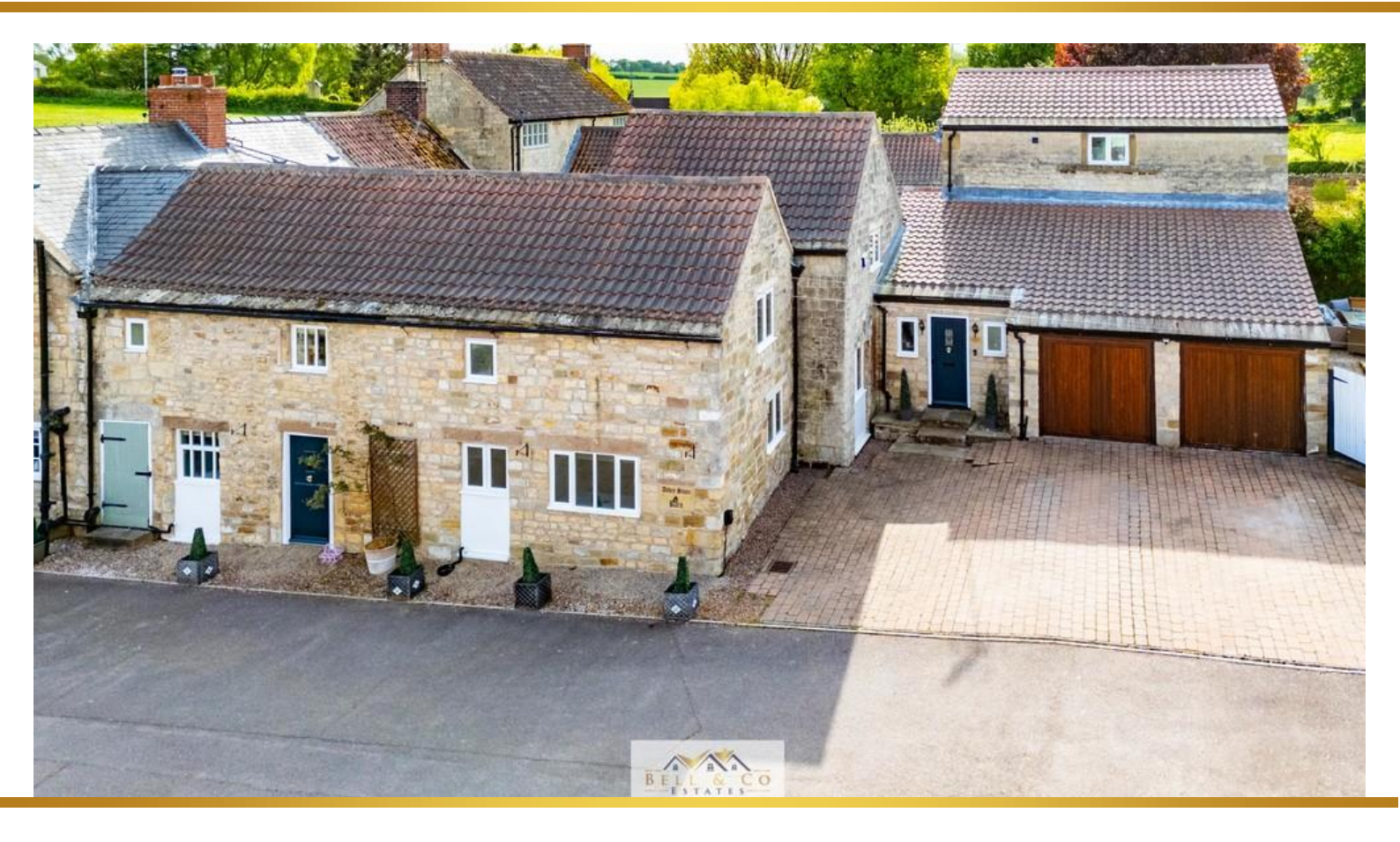
Abbey Stone Barn | Main Street | Brookhouse | S25 1YA