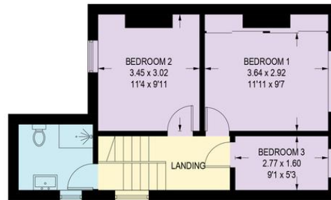
FIRST FLOOR 37.7 SQ M / 406 SQ FT