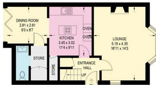
GROUND FLOOR 48.1 SQ M / 518 SQ FT