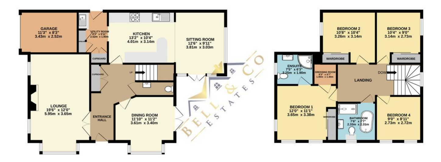
1ST FLOOR 654 sq.ft. (60.8 sq.m.) approx.