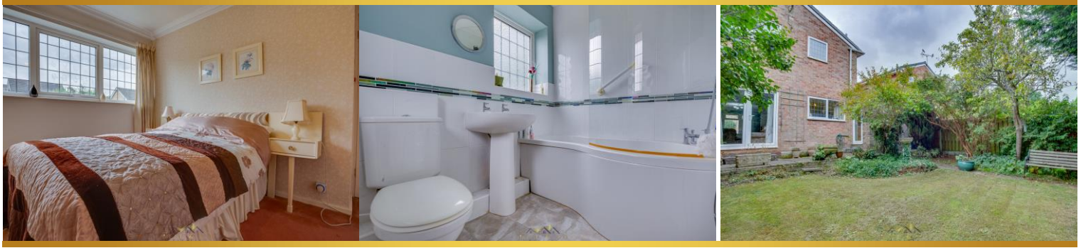
GROUND FLOOR 639 sq.ft. (59.4 sq.m.) approx.