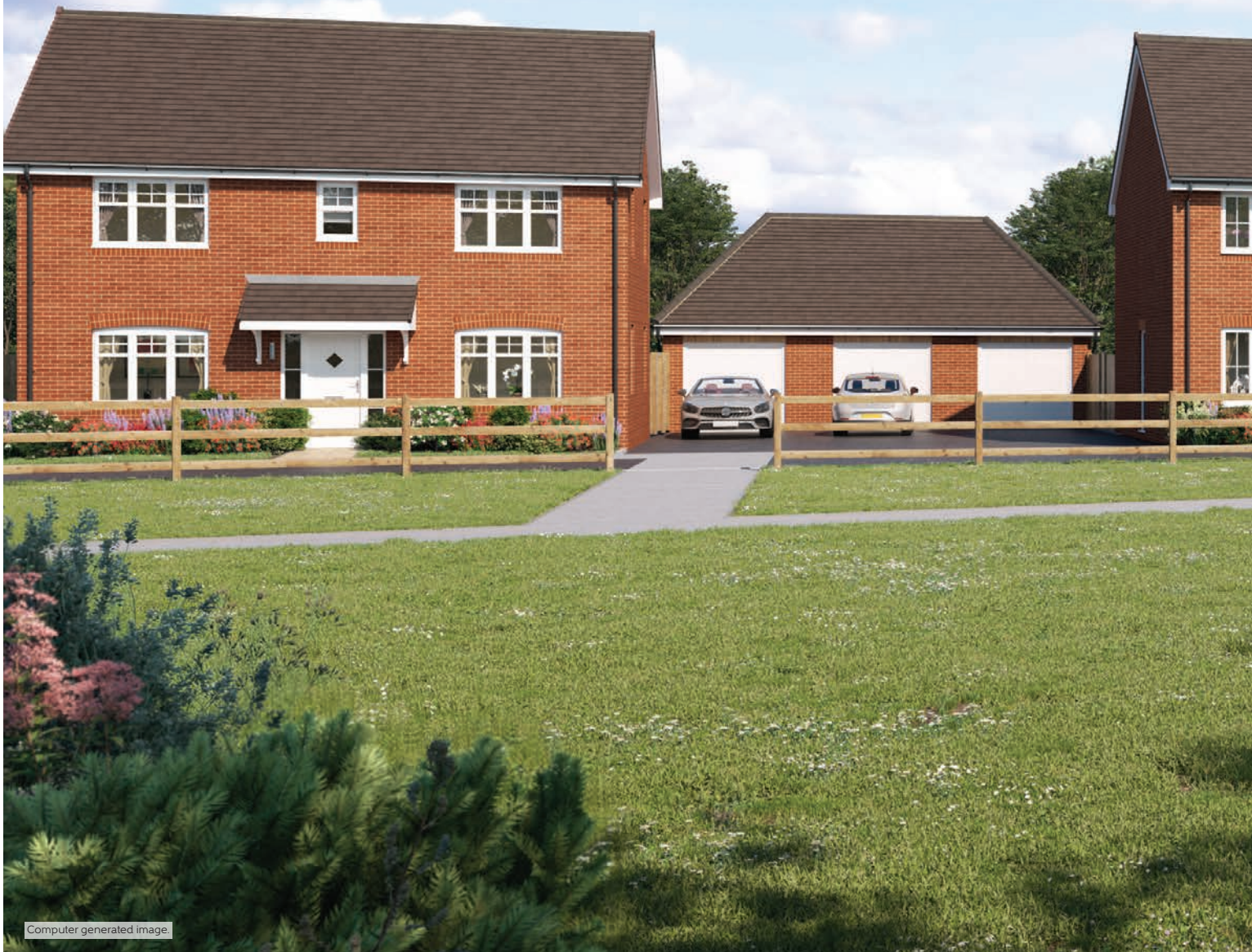
Computer generated image.