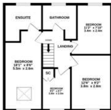
TOTAL FLOOR AREA: 1462 sq.ft. (137.7 sq.m.) approx.

Where every effort has been made to ensure the accuracy of the 'Sample' contained herein, measurements of areas, volumes, counts and any other matter are approximate and no responsibility is taken for any error, omission or mis-statement. This plan is for illustrative purposes only and should be used as such for any prospective purchase. The vendor, agent and any other person involved in the sale of the property do not guarantee as to their accuracy or otherwise. Made with Metreplan 2024