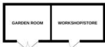
GROUND FLOOR 896 sq.ft. (83.3 sq.m.) approx.