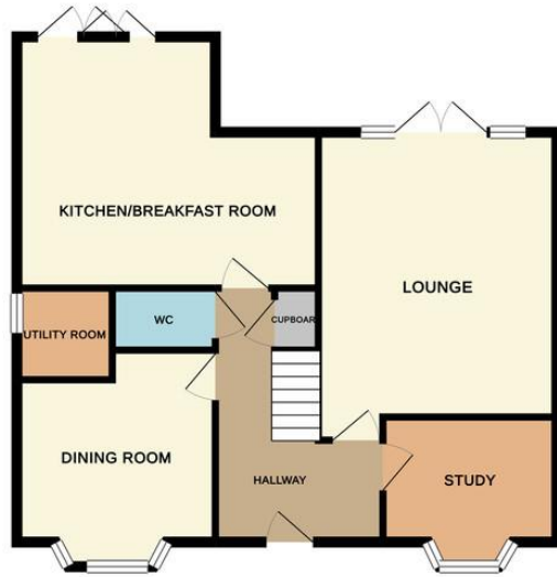
GROUND FLOOR 705 sq. ft. (65.5 sq. m.) approx.