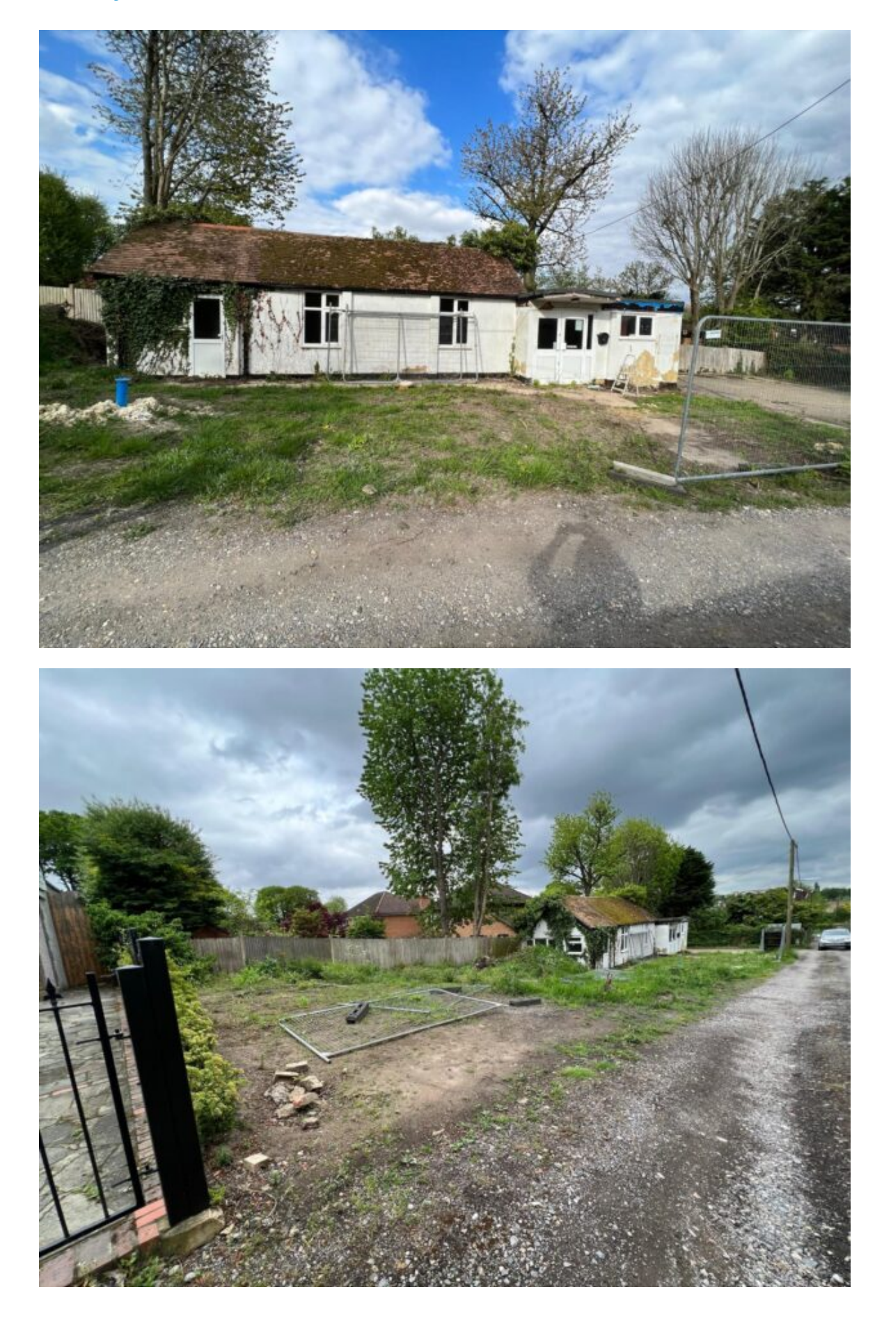
Please refer to terms & conditions set out under Important Notice on the last page