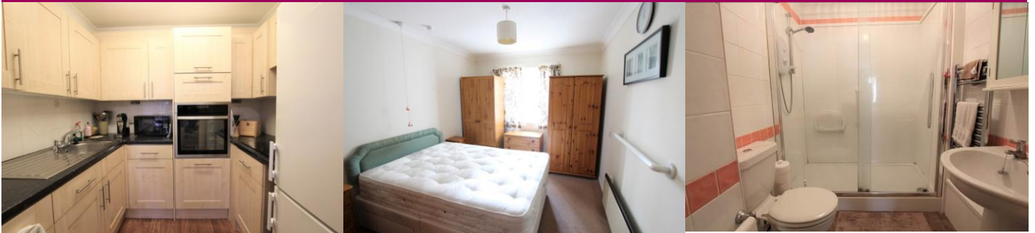
GROUND FLOOR 622 sq.ft. (57.8 sq.m.) approx.