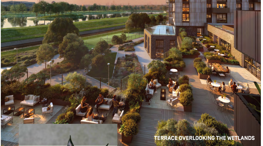
TERRACE OVERLOOKING THE WETLANDS