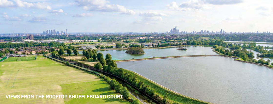
VIEWS FROM THE ROOFTOP SHUFFLEBOARD COURT