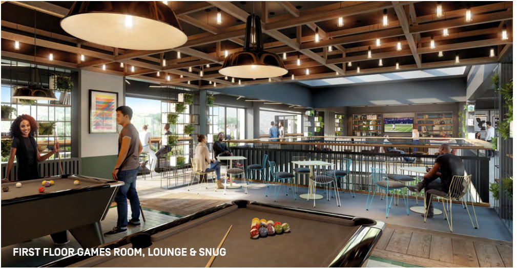
FIRST FLOOR GAMES ROOM, LOUNGE & SNUG