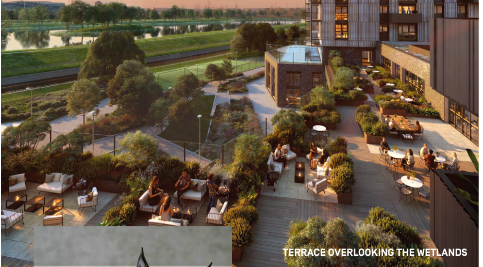
TERRACE OVERLOOKING THE WETLANDS