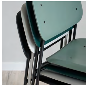
FURNITURE PACK ARMCHAIR, MARBLE COFFEE TABLE AND HAY DINING CHAIRS