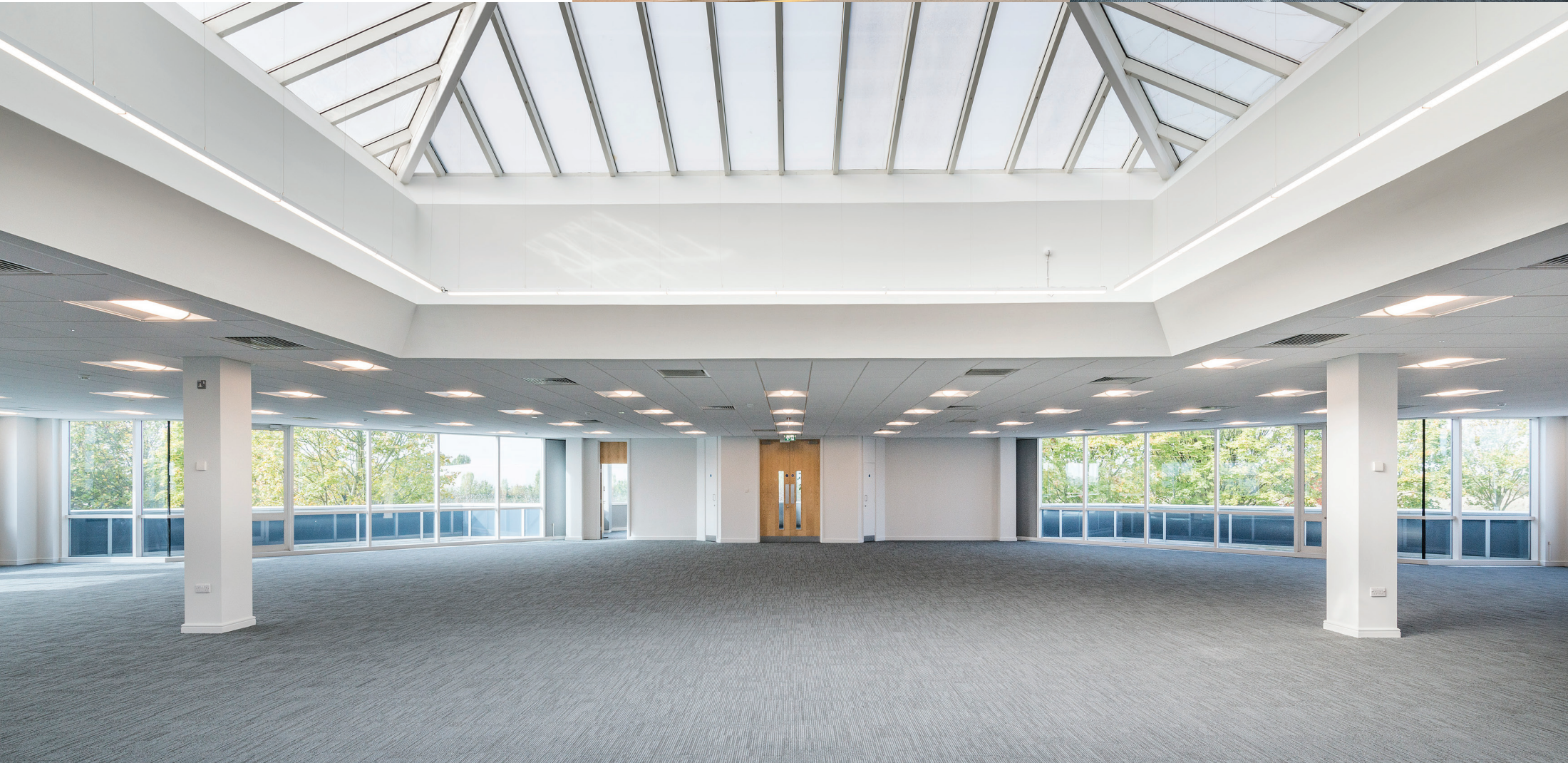
First floor suite