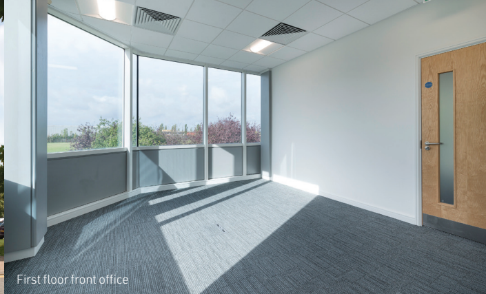
First floor front office