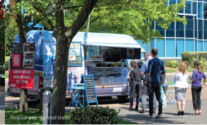
Regular pop-up food stalls