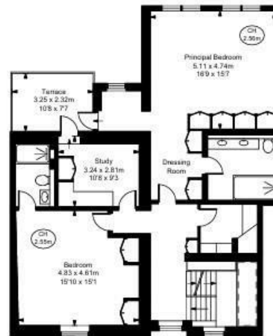
First Floor Approximate Gross Internal Area 103.62 sq m / 1,115 sq ft