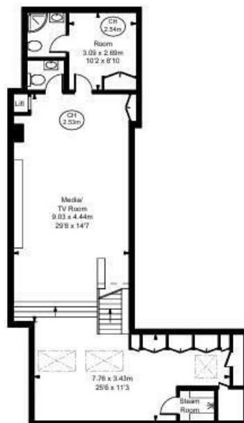
Lower Ground Floor Approximate Gross Internal Area 86.14 sq m / 927 sq ft