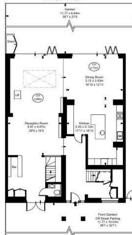
Ground Floor Approximate Gross Internal Area 132.73 sq m / 1,429 sq ft