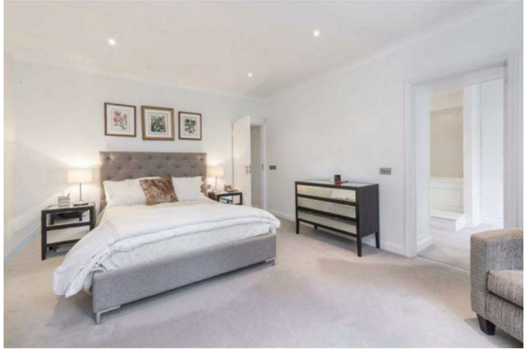
Grove End Road, St. John's Wood, NW8 9LB