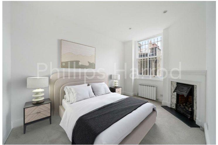
Vale Court, Maida Vale, London, W9 Approximate Gross Internal Area 2145 sq ft - 199 sq m