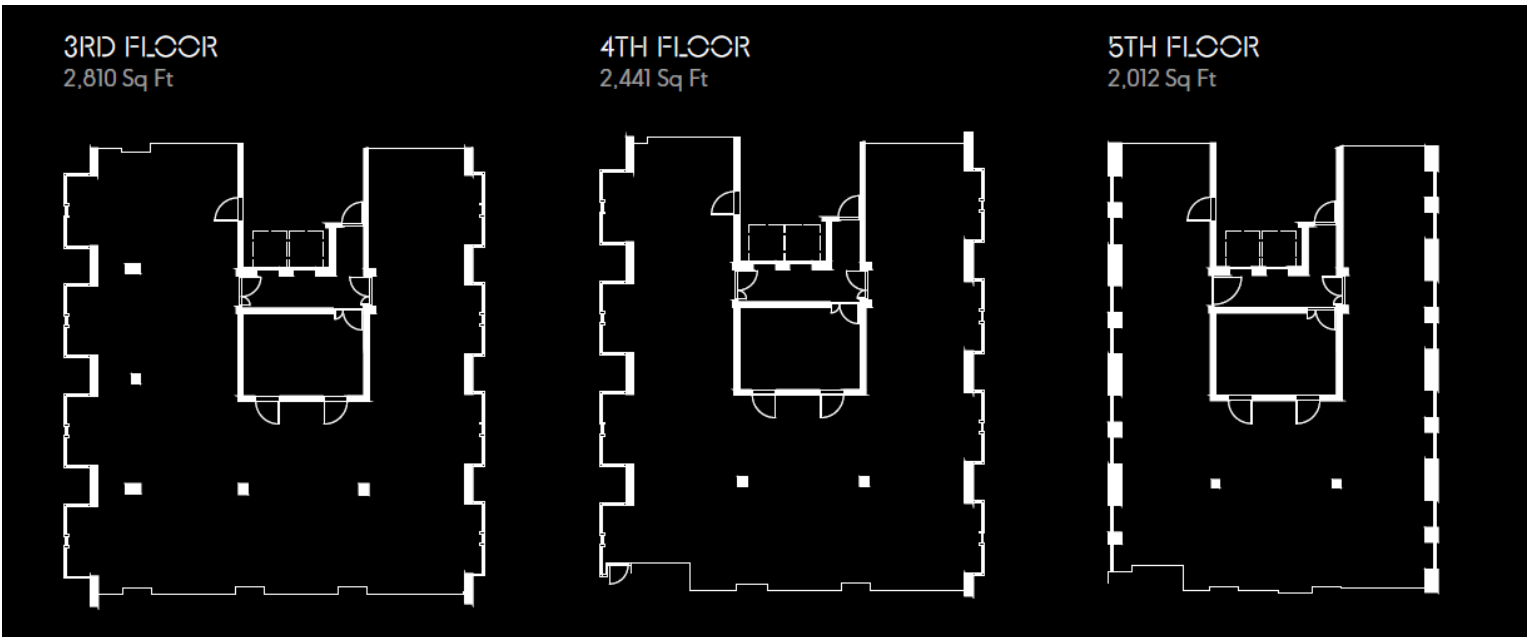
Indicative floor plans from brochure

Floor Plans - Click here for a virtual tour