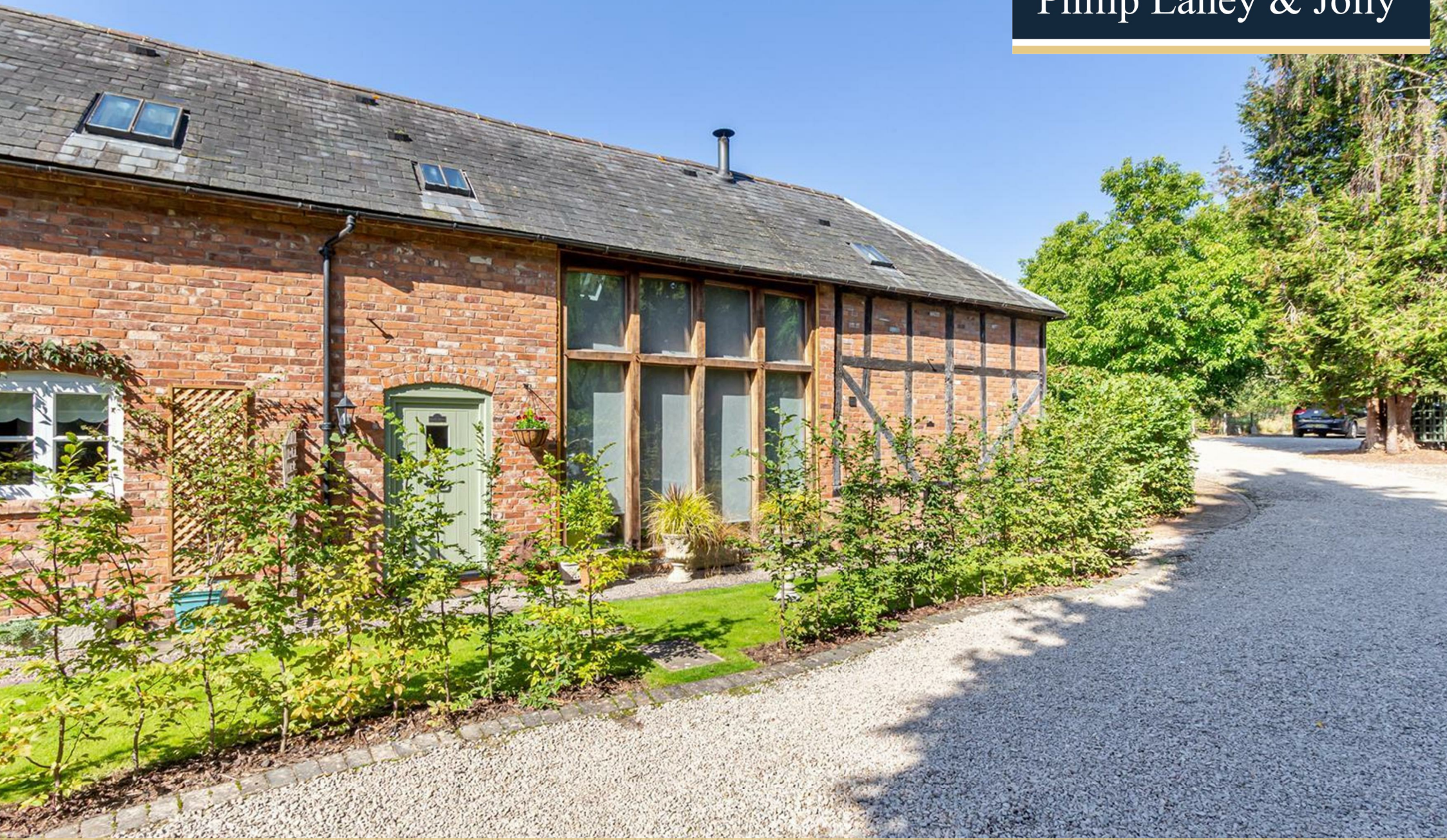
The Coach House Boat Lane, Worcester, WR6 5RS Offers Over £250,000