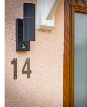
Illustration for identification purposes only, measurements approximate, not to scale. Copyright