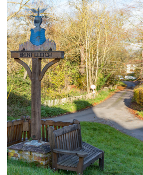
Illustration for identification purposes only, measurements approximate, not to scale. Copyright

Floor Area 1318 sq. ft / 122.47 sq. m. Garage Area 420 sq. ft / 39.04 sq. m.