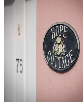
Illustration for identification purposes only, measurements approximate, not to scale. Copyright

Approx. Gross Internal Floor Area 1029 sq. ft / 95.60 sq. m.