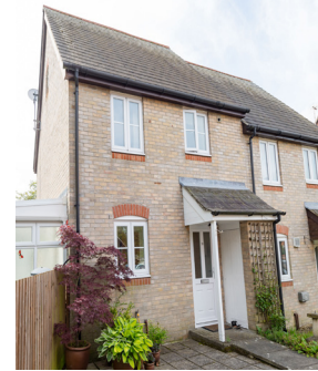
illustration for identification purposes only, measurements approximate, not to scale. Copyright

Approx. Gross Internal Floor Area 729 sq. ft / 67.65 sq. m.