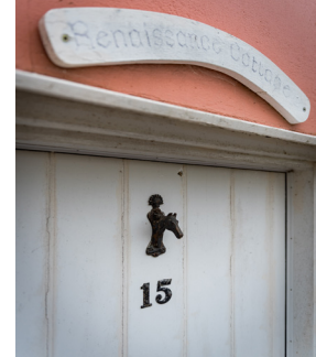
Illustration for identification purposes only, measurements approximate, not to scale. Copyright

Approx. Gross Internal Floor Area 652 sq. ft / 60.58 sq. m.