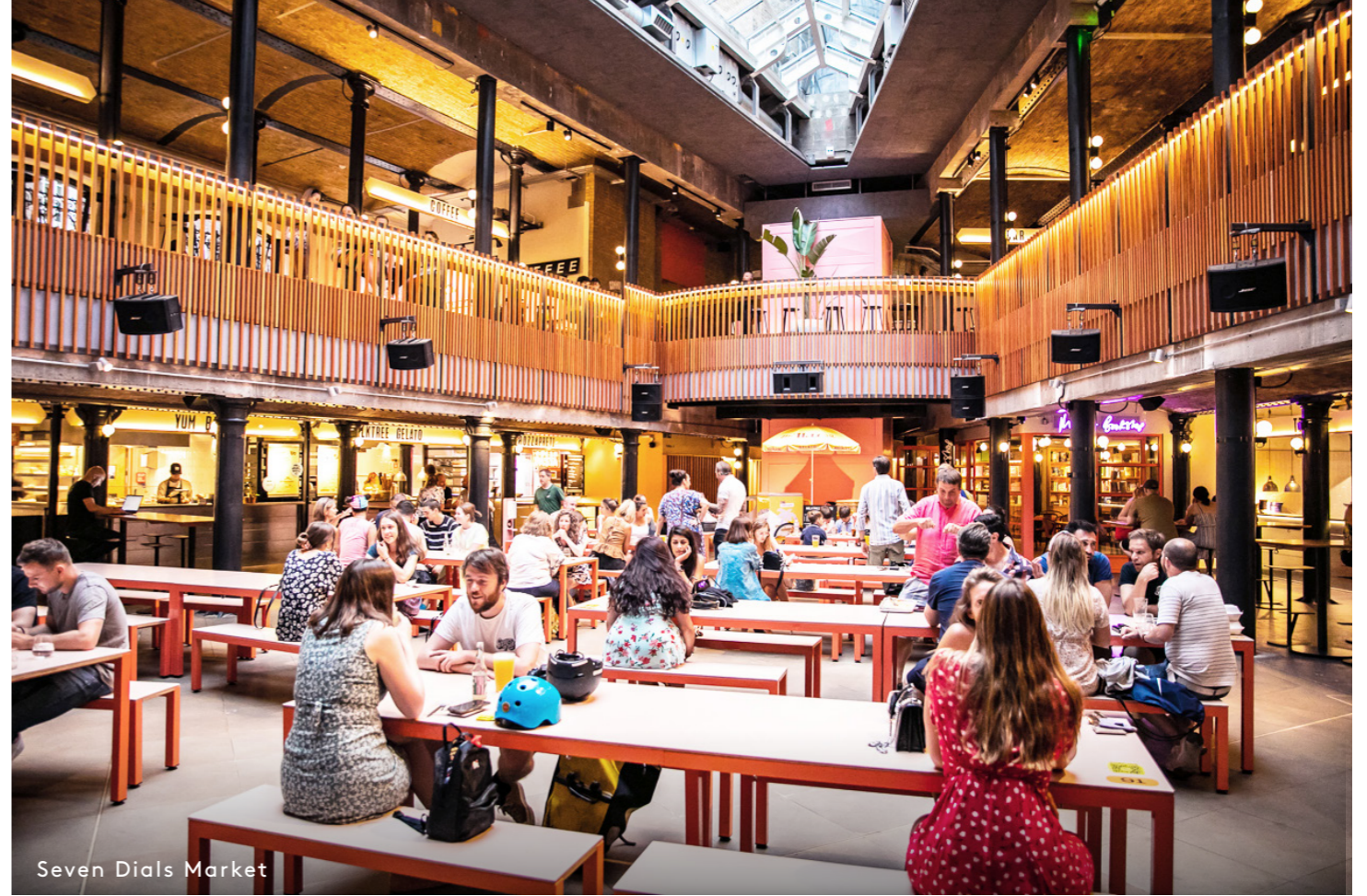
Seven Dials Market