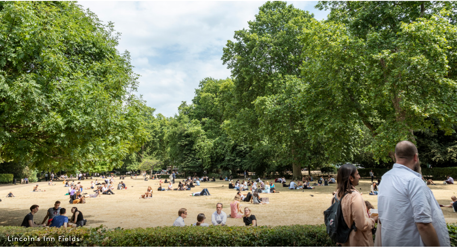
Lincoln's Inn Fields