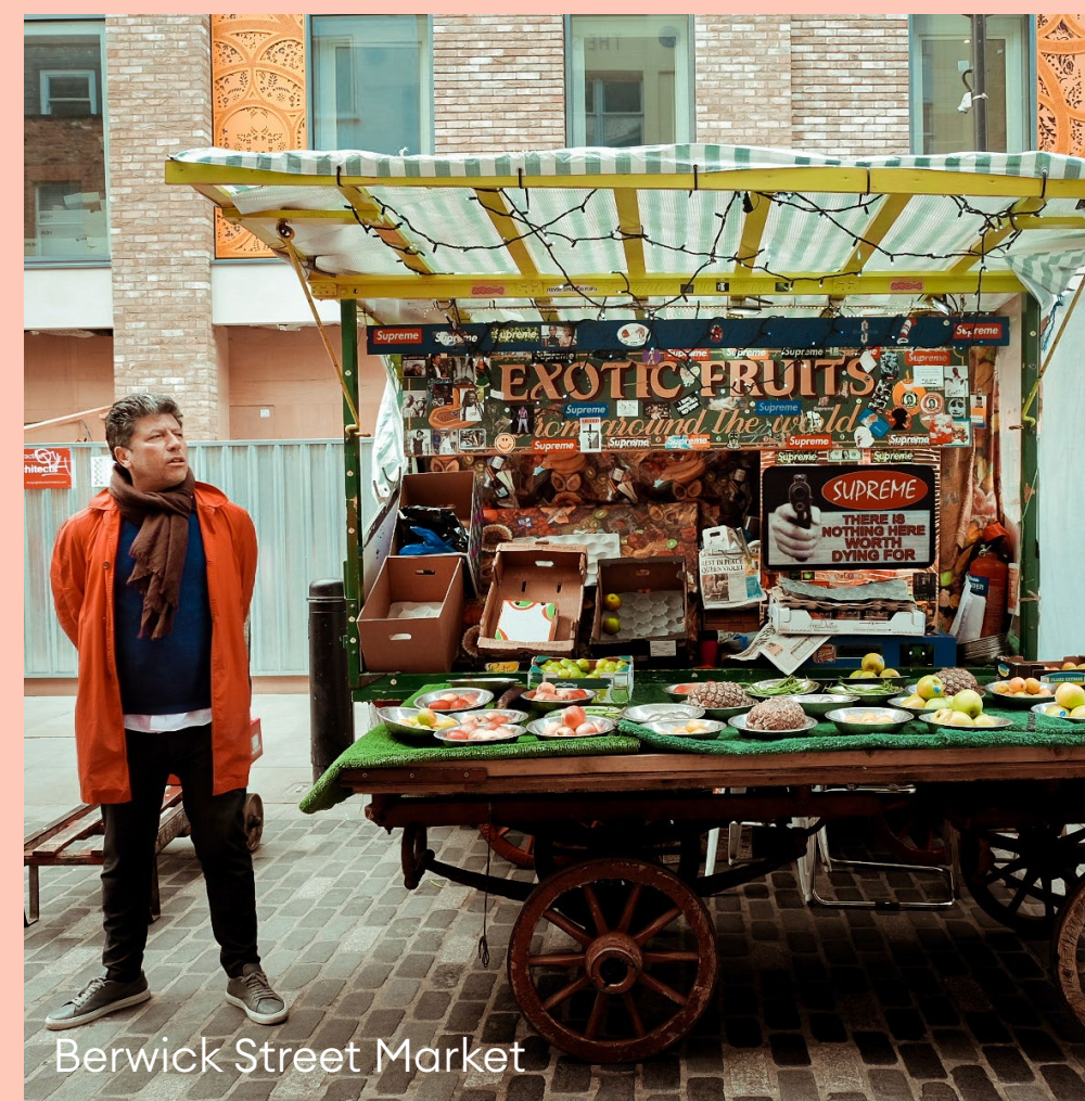
Berwick Street Market