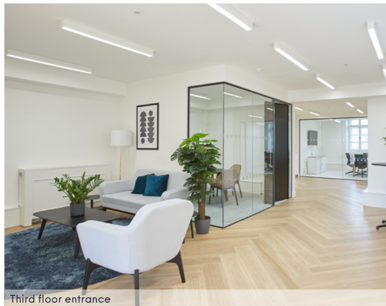
Third floor entrance