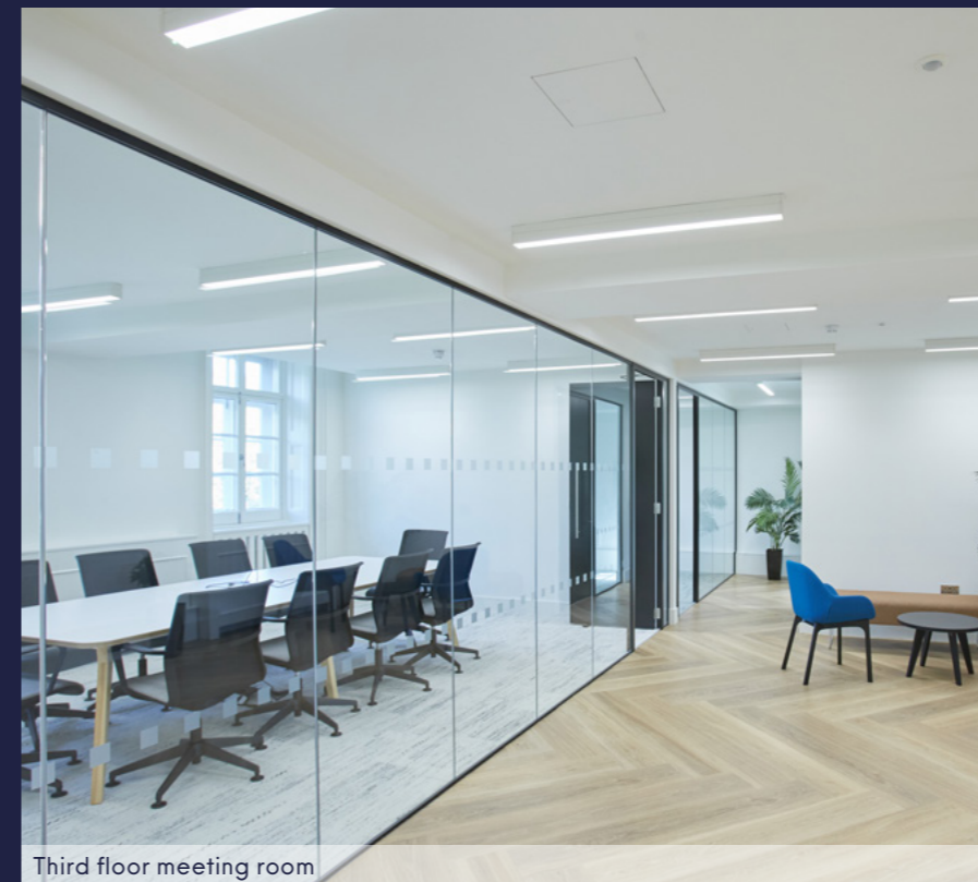
Third floor meeting room