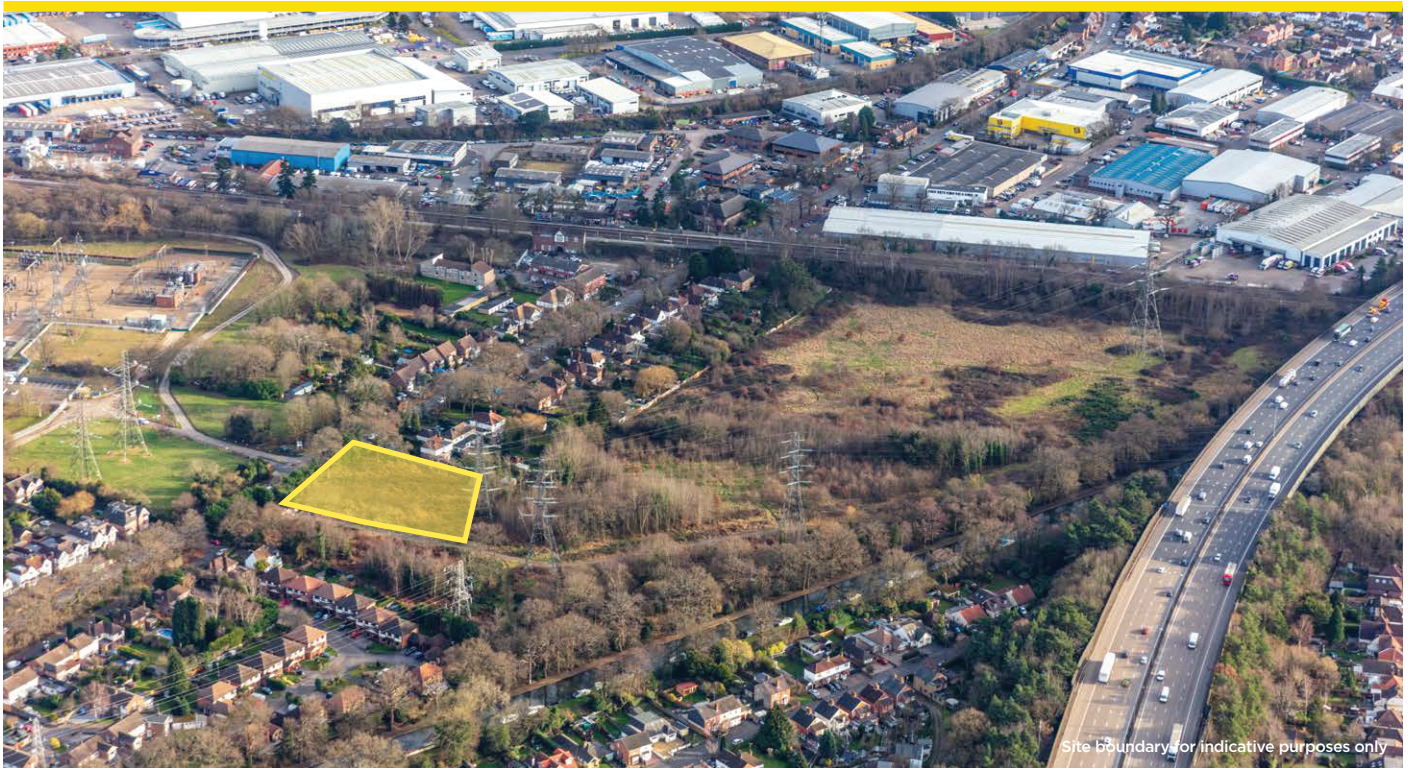
Site boundary for indicative purposes only