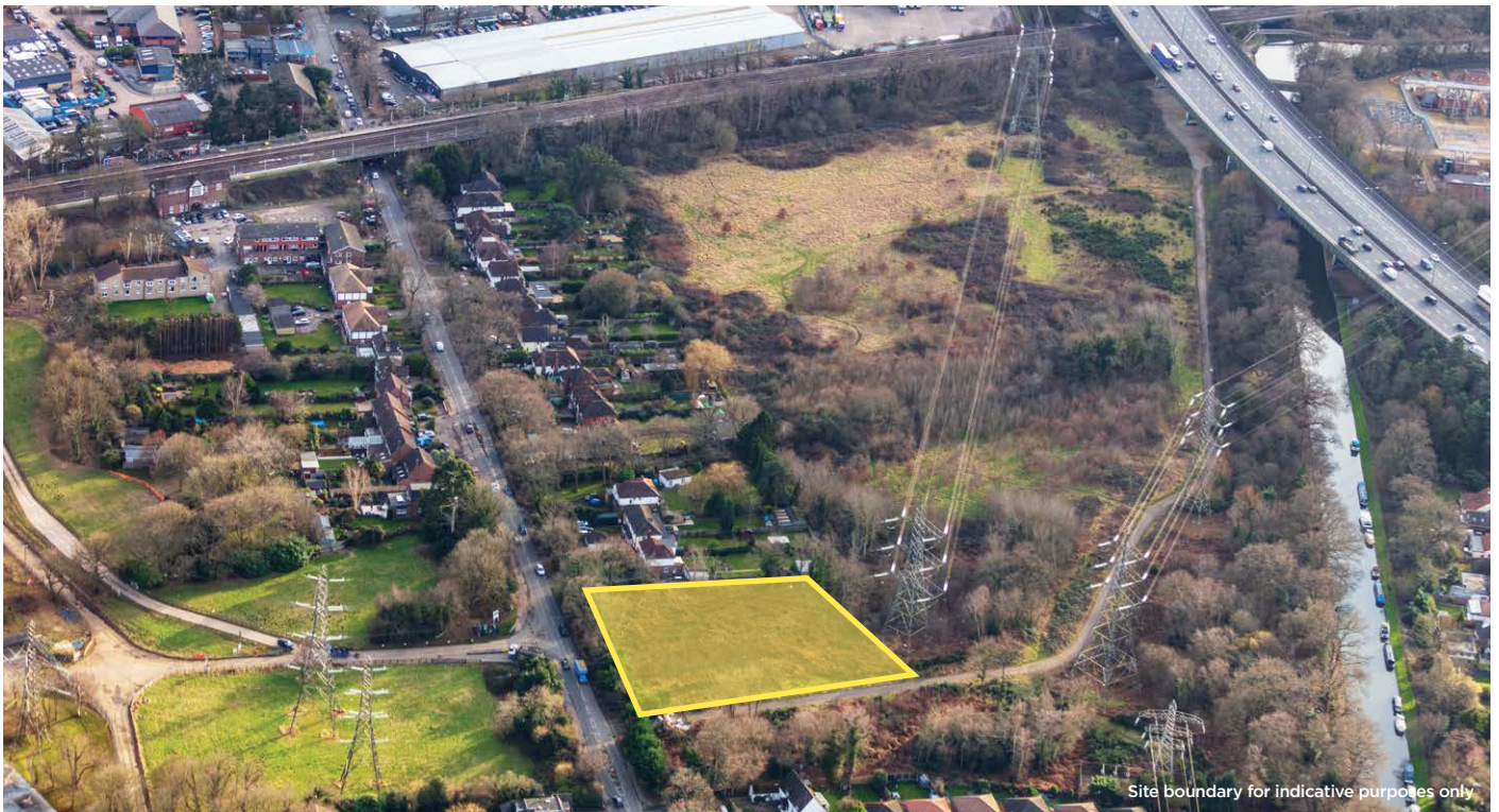
Site boundary for indicative purposes only