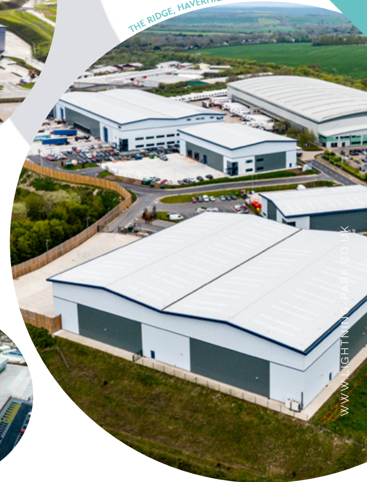
THE RIDGE, HAVERHILL