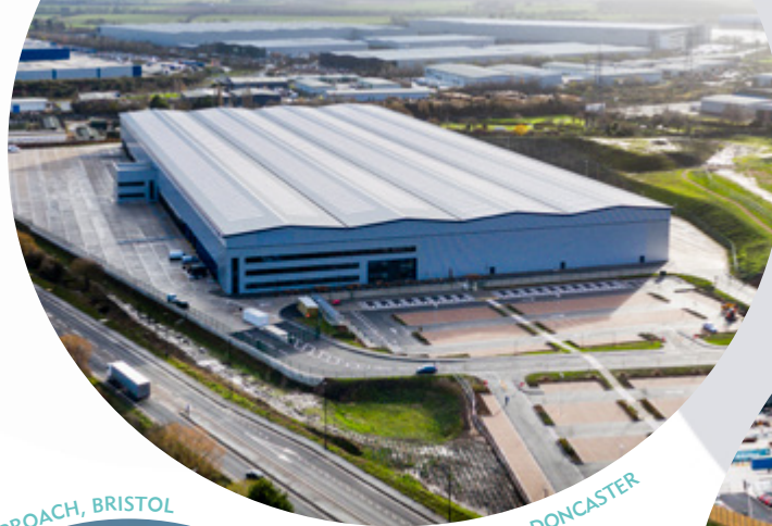
GATEWAY 4, DONCASTER

Most importantly, we have skin in the game. We're a private, owner-managed organisation with no PLC or string of shareholders to report to. Decisions are made quickly and we apply a more hands-on approach in order to make your business, our business.