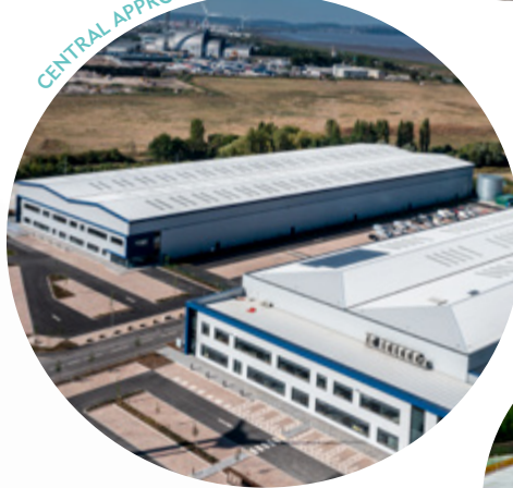
CENTRAL APPROACH, BRISTOL