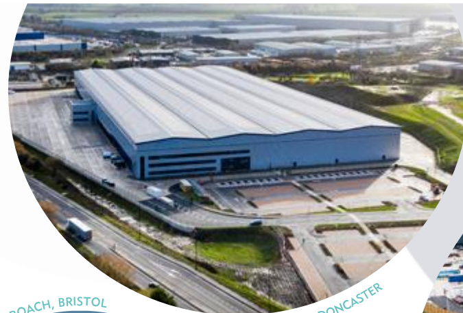
GATEWAY 4, DONCASTER

Most importantly, we have skin in the game. We're a private, owner-managed organisation with no PLC or string of shareholders to report to. Decisions are made quickly and we apply a more hands-on approach in order to make your business, our business.