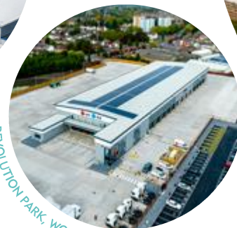
REVOLUTION PARK, WOLVERHAMPTON