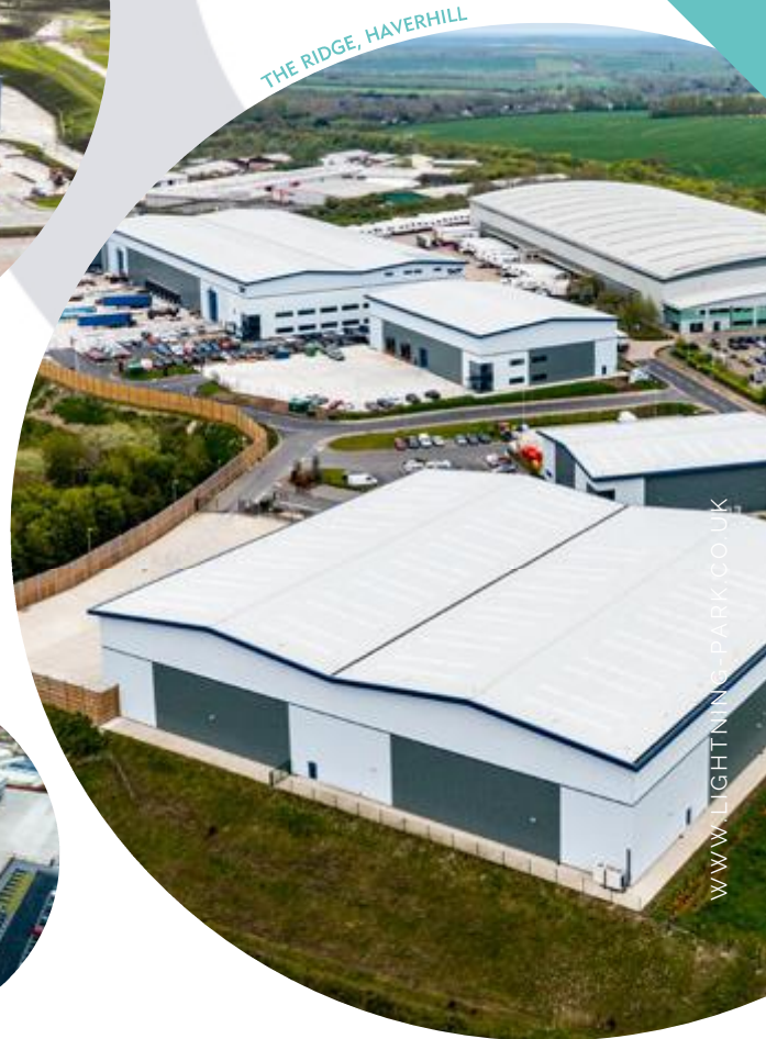
THE RIDGE, HAVERHILL