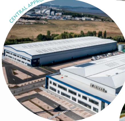
CENTRAL APPROACH, BRISTOL