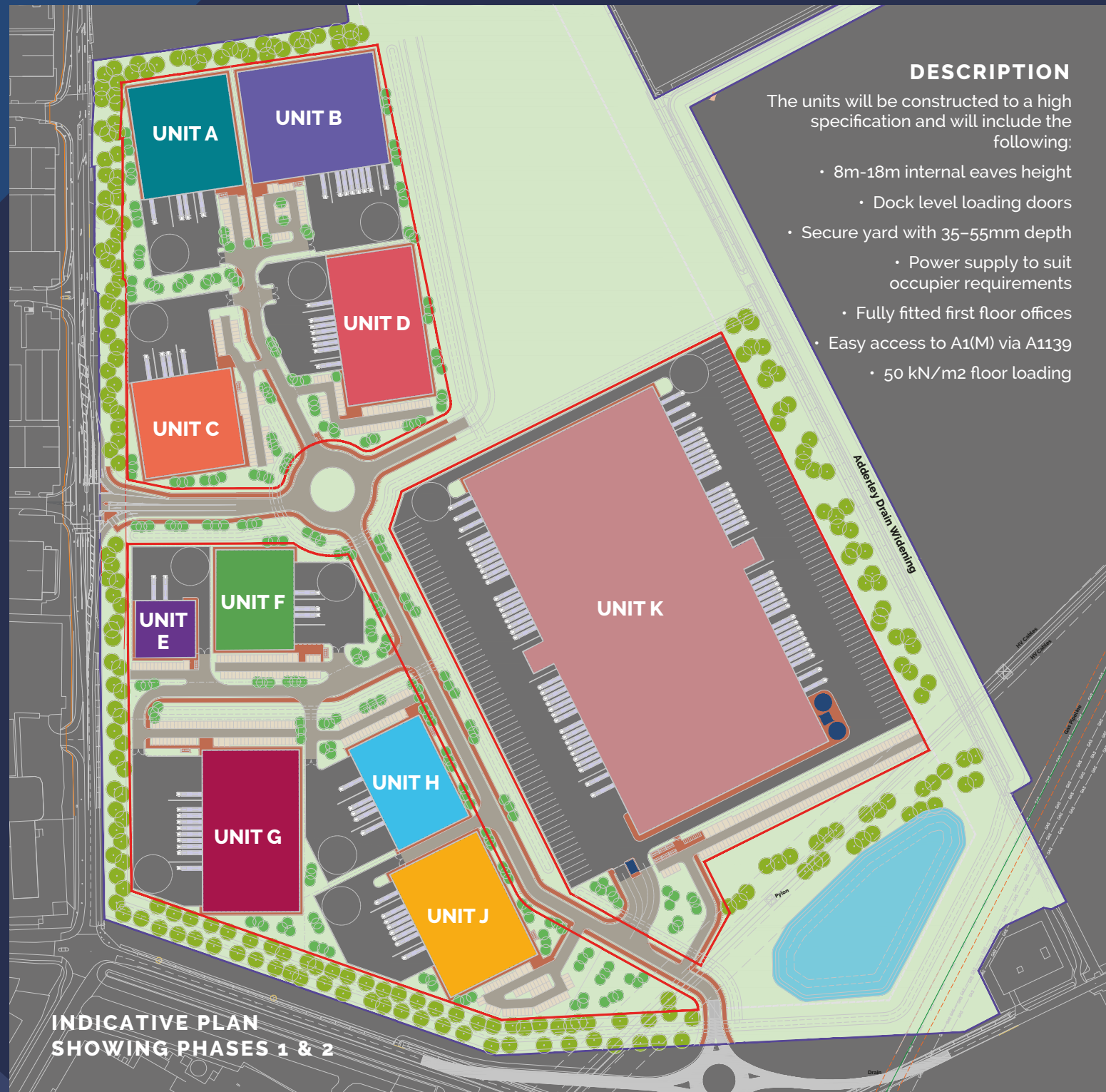
INDICATIVE PLAN SHOWING PHASES 1 & 2