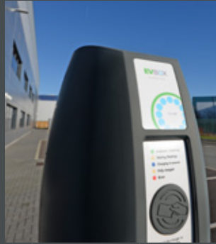
EV CHARGING POINT