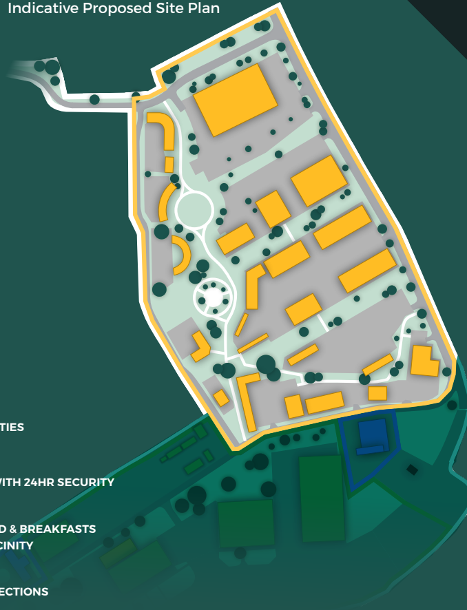
Indicative Proposed Site Plan

Church Fenton Production is based at the former Leeds East Airport, this ex Royal Air Force base was originally home to the first RAF 'Eagle' Squadron of American World War II volunteers, made famous in the feature film Pearl Harbour.