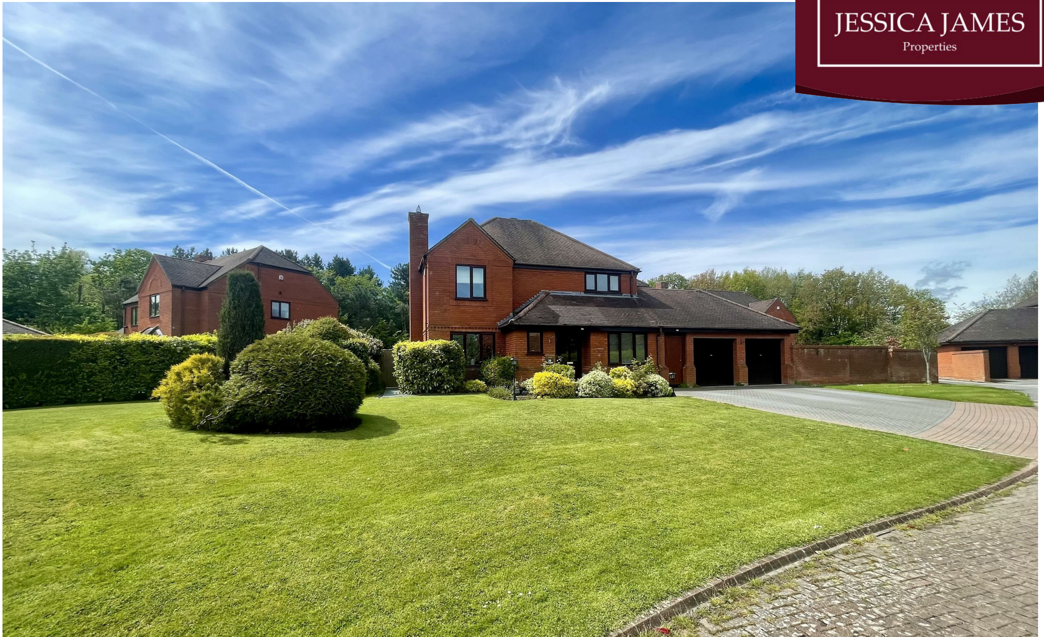
39 The Bramptons, Shaw, Swindon, SN5 5SL Offers Over £700,000