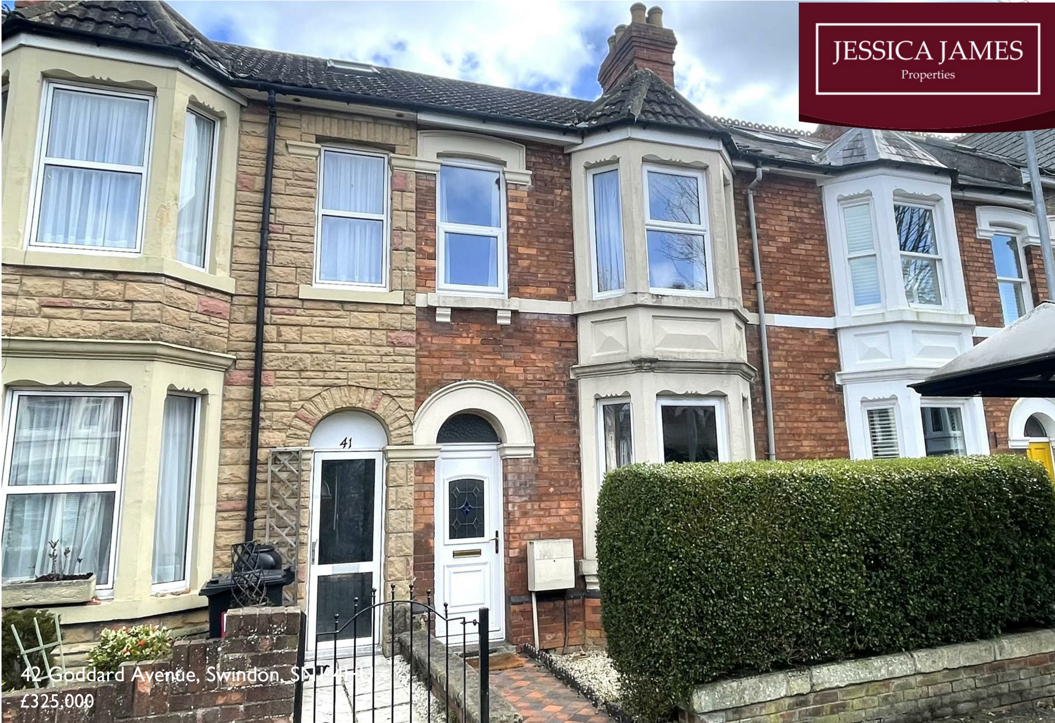
42 Goddard Avenue, Swindon, SN1 4HL £325,000