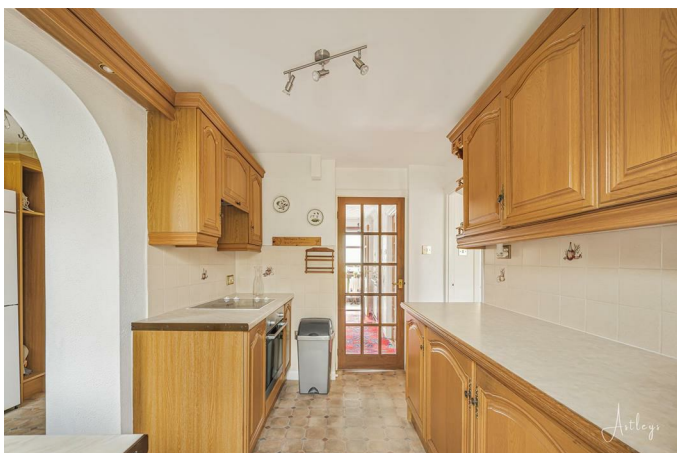
Lino flooring, a range of wooden base and wall units,

electric hob and even with extractor fan over, space for washing machine, tumble dryer and dishwasher, integrated fridge and freezer stainless steel sink and drainer with mixer tap, radiator and door to garden. Door to wet room.