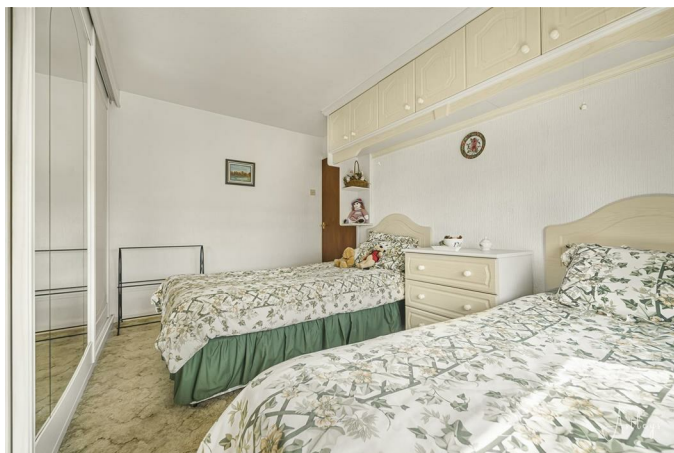
Bedroom 1 13'6" x 9'11" (into wardrobe) (4.14 x 3.03 (into wardrobe))

Built in wardrobes and cupboards, window to front and radiator.