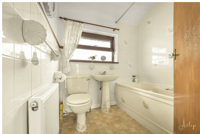
Bathroom 6'4" x 6'5" (1.94 x 1.98)

Three piece beige suite with lino floor, window to the back and radiator.