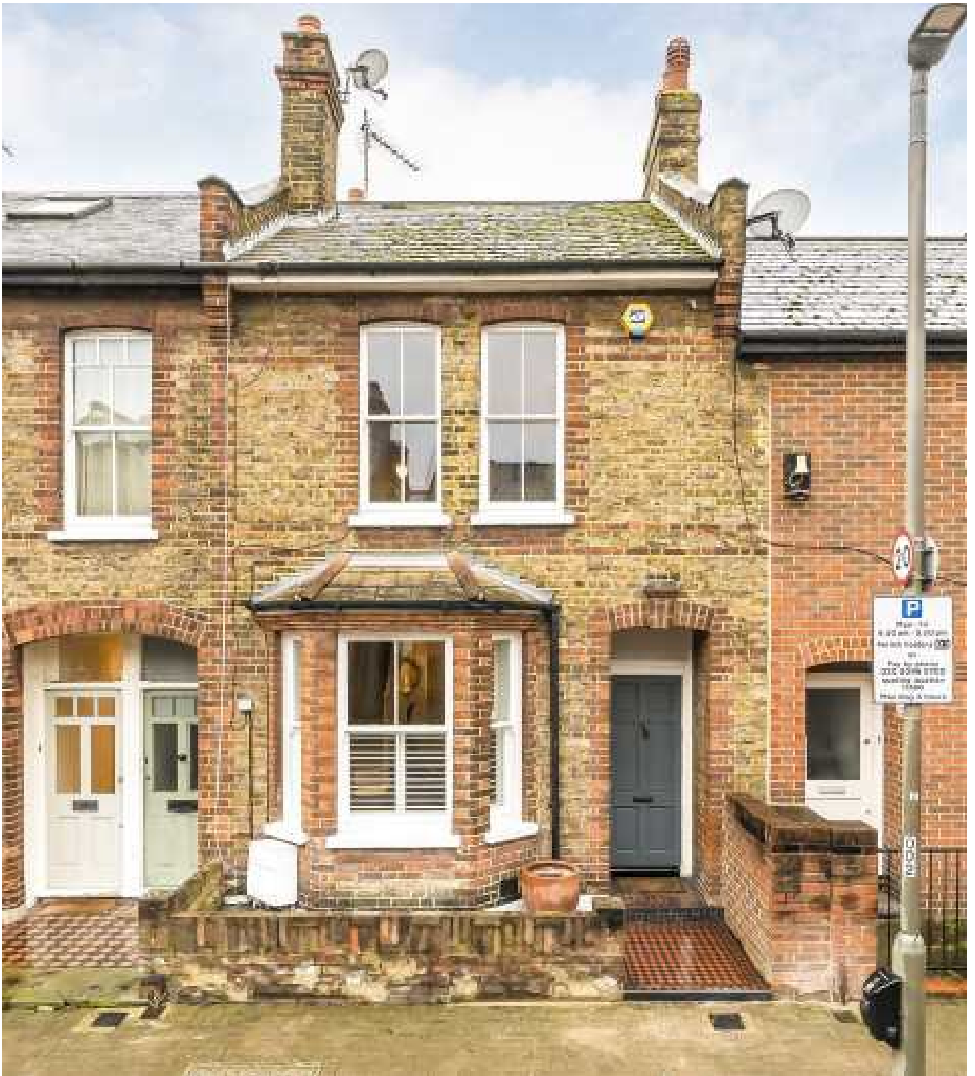
Tennyson Street, SW8 £950,000