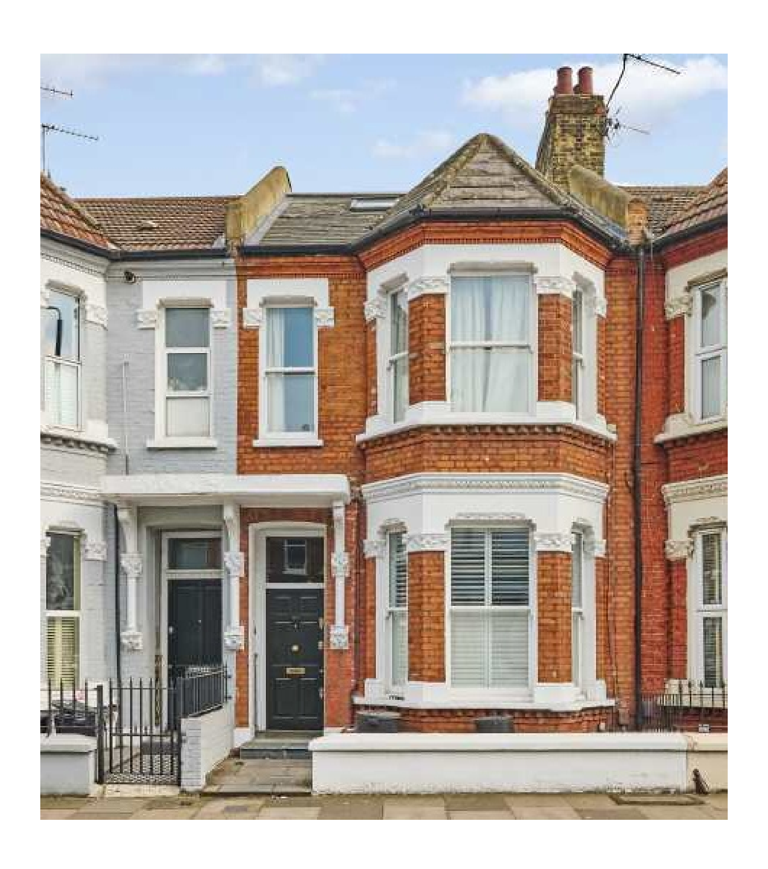
Elspeth Road, SW11 £1,350,000