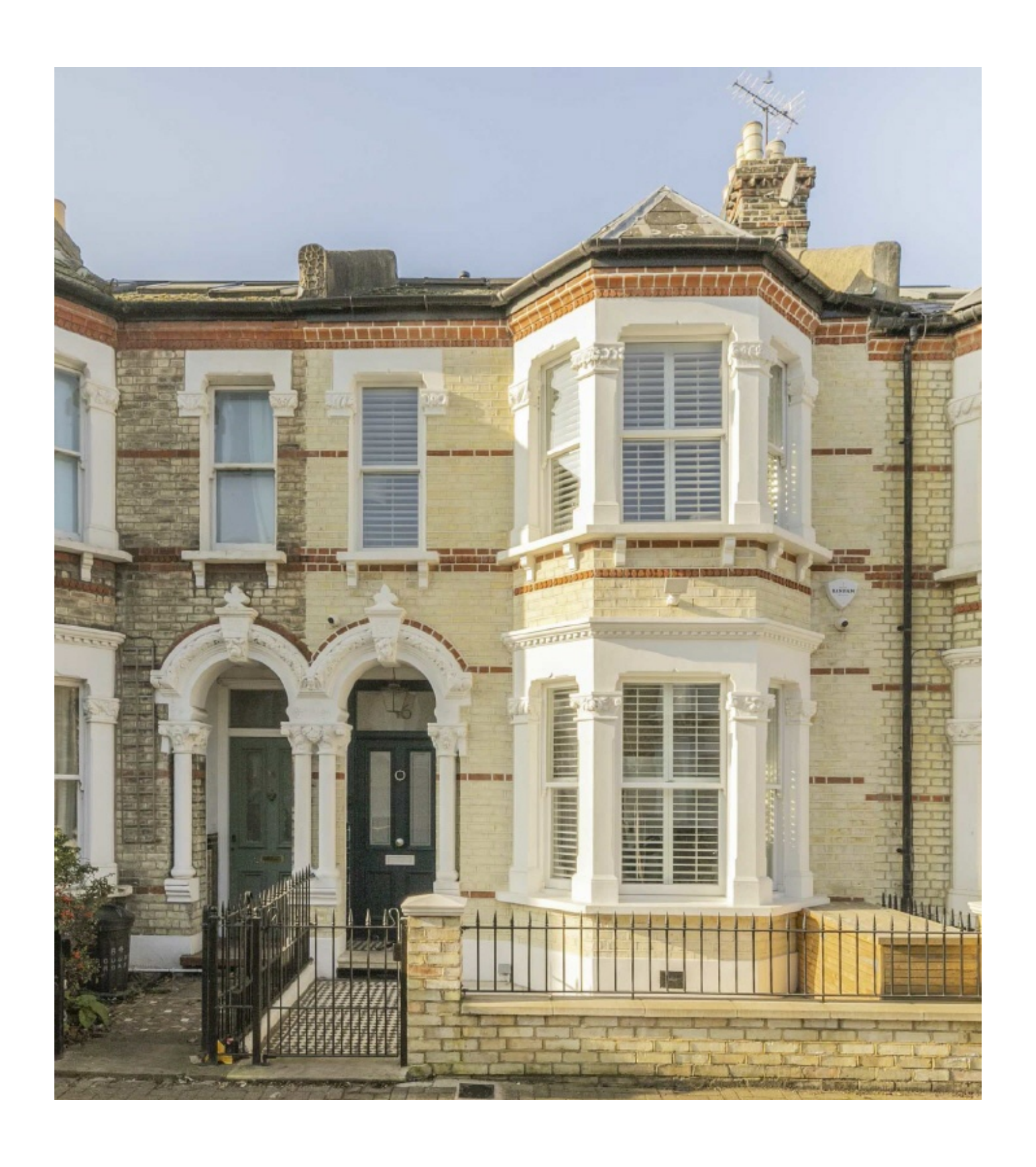
Wroughton Road, SW11 £1,875,000