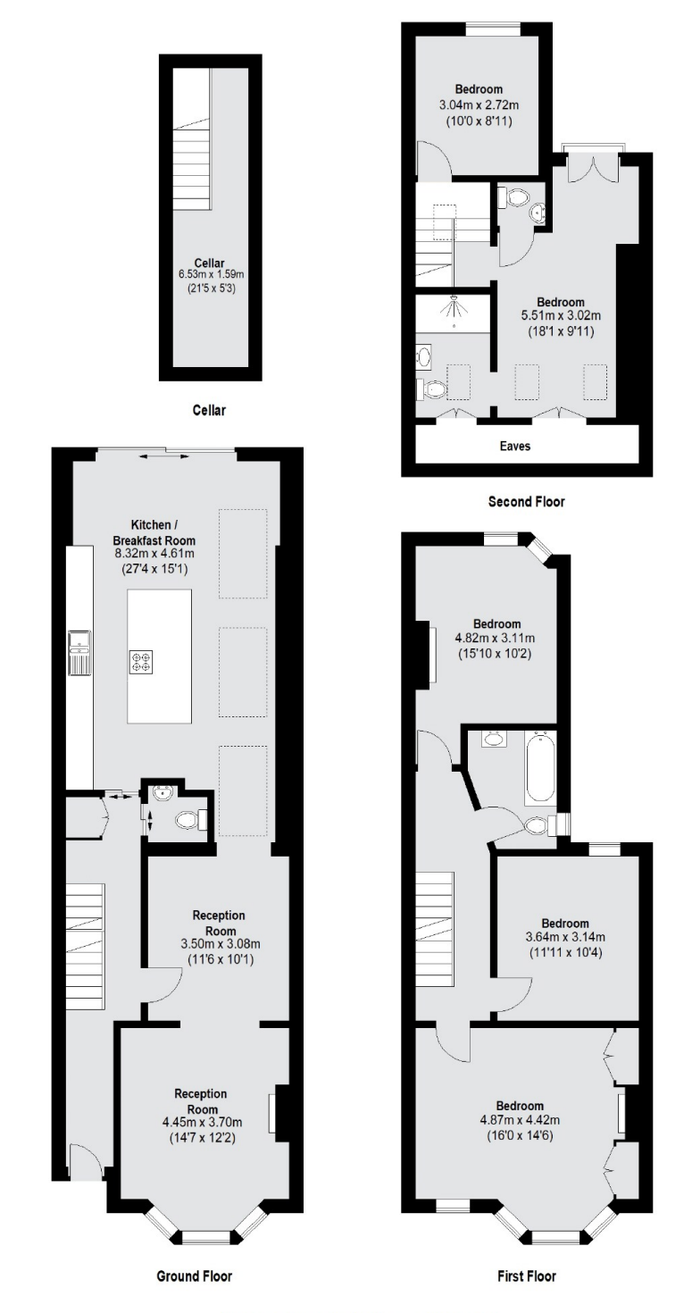
Total area (approx.): 182.28 sq. m (1962 Sq. ft) (Excluding Eaves)