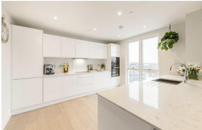
Yelverton Road, SW11