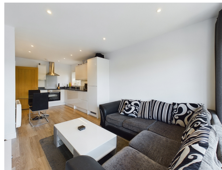
Asking Price | £1,300