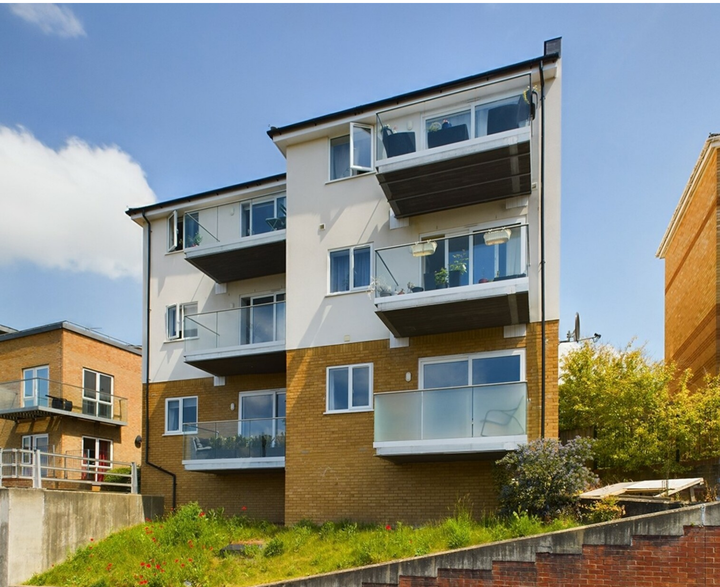
Flat 1 Jem House, Grove Gardens, High Wycombe, HP13 7JG