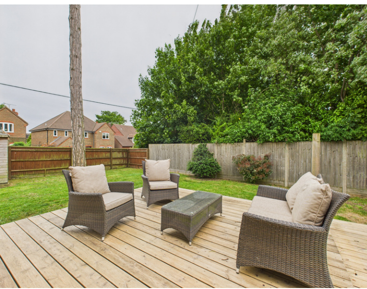
Jasmine Corner, Long Hide, Princes Risborough, Buckinghamshire, HP27 0JX