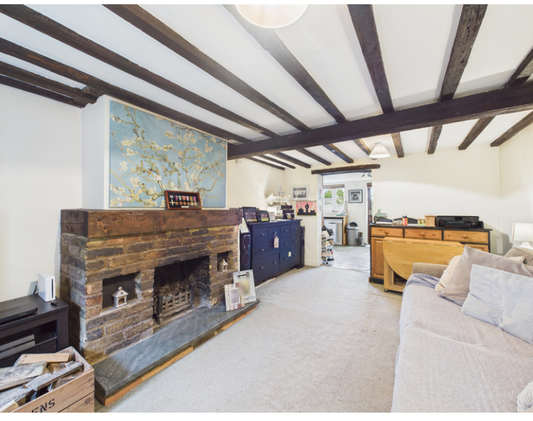
Appletree Cottage, Nairdwood Lane, Prestwood, Great Missenden, Buckinghamshire, HP16 0QQ