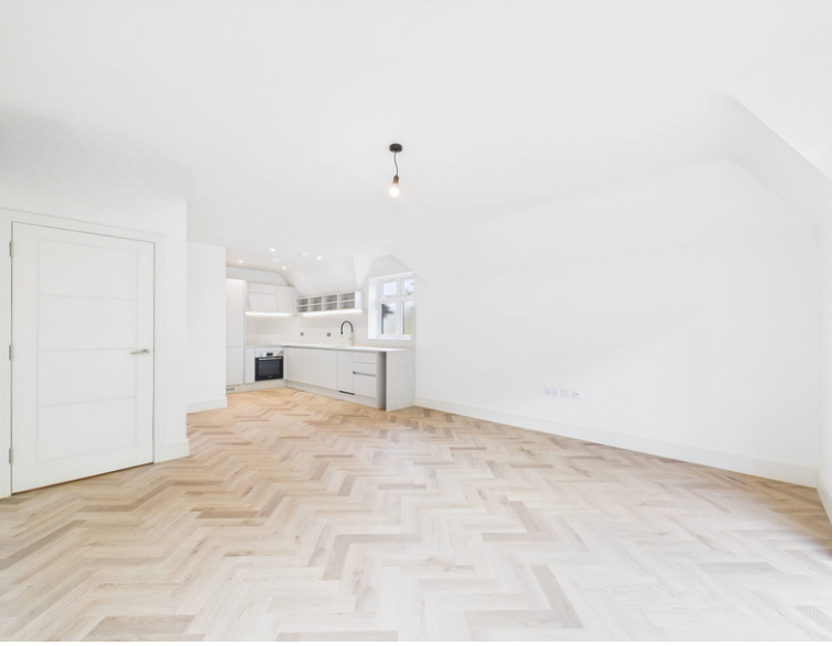
Flat 9, 141 London Road, High Wycombe, Buckinghamshire, HP11 1BT