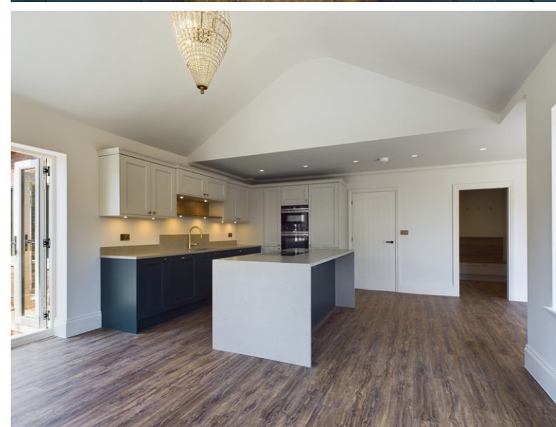
Asking Price | £3,000