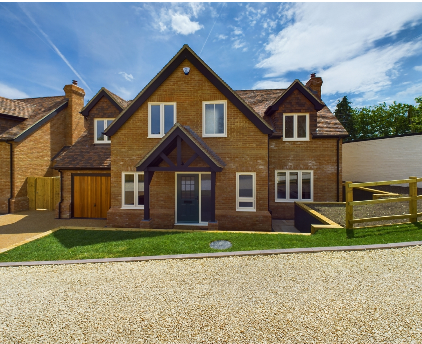
1 Appleyard Close, Whitchurch, Aylesbury, Buckinghamshire, HP22 4FX