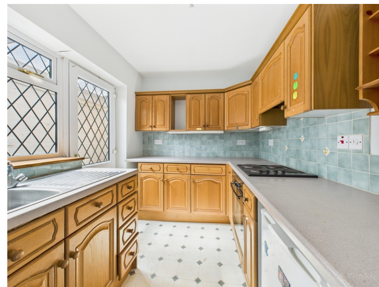
Jasmine, Chapel Hill, Speen, Speen, Buckinghamshire, HP27 0SL