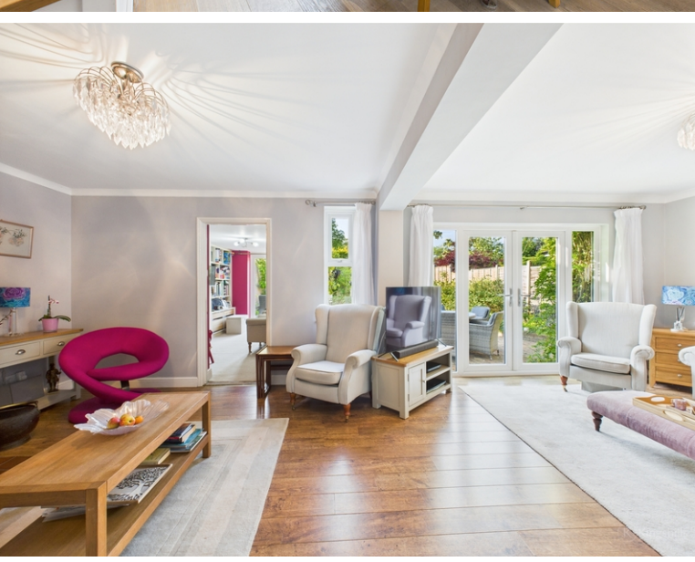
Megan Cottage, Windsor Lane, Little Kingshill, Great Missenden, Buckinghamshire, HP16 0DP