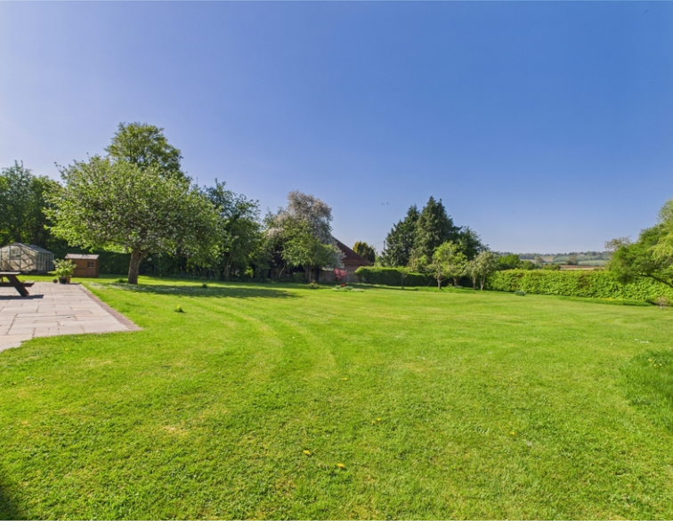
1 Little Lane, Saunderton, Princes Risborough, Buckinghamshire, HP27 9NW