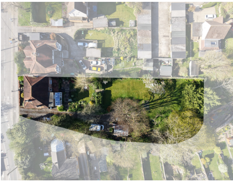
Wayside, 2 Station Road, Princes Risborough, Buckinghamshire, HP27 9DF