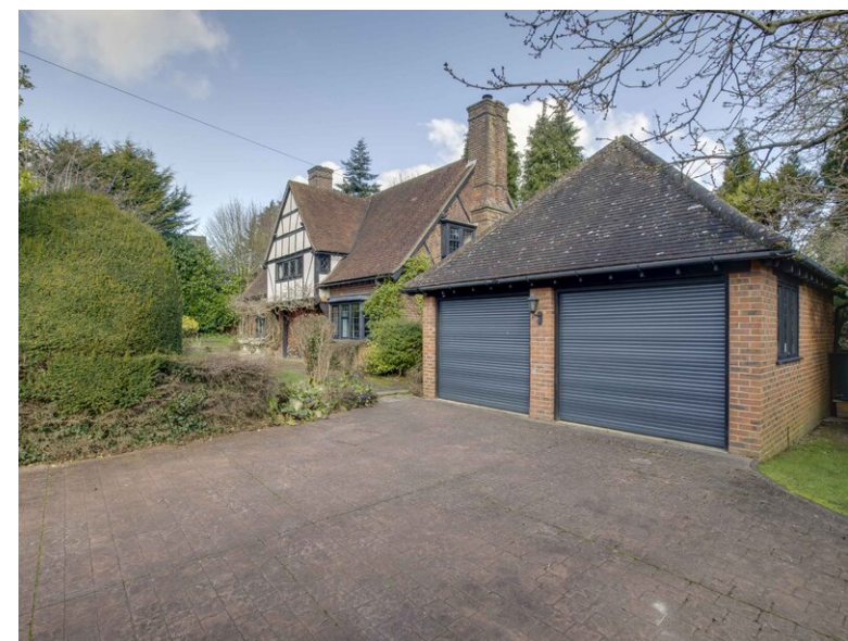
Old Barns Cottage, Finch Lane, Beaconsfield, Buckinghamshire, HP9 2TL