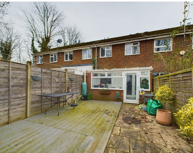
18 The Chase, Marlow, Buckinghamshire, SL7 1UU