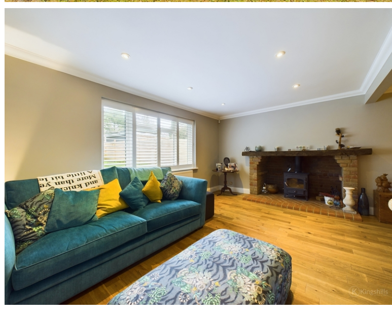
Orchard Lodge, Fagnall Lane, Winchmore Hill, Amersham, Buckinghamshire, HP7 0PG